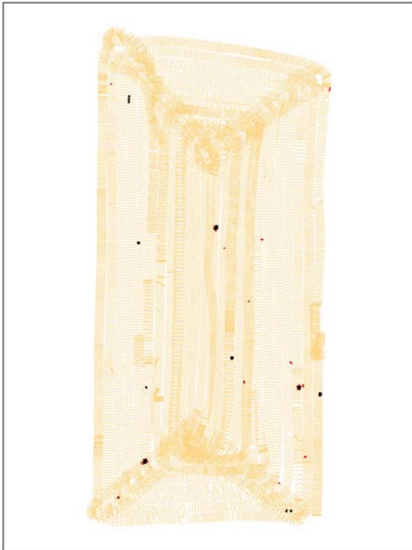
Fig 4. Scanning Pad Initial Survey