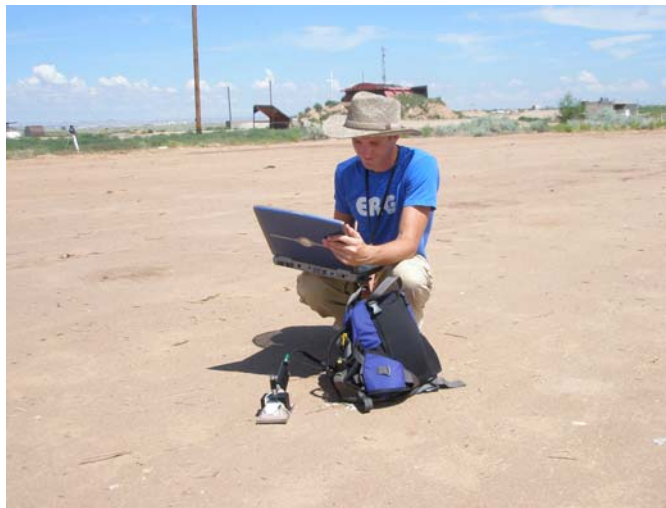
Fig 2. Returning to hot spots using handheld 3-DISS sensor and laptop