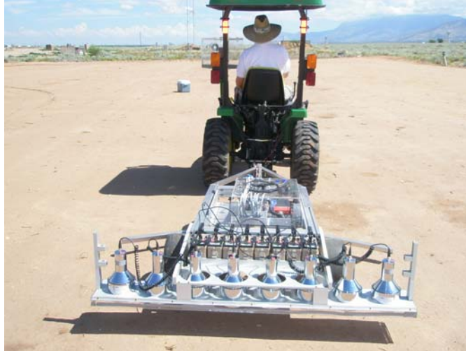
Fig 1. Array of 8 FIDLER detectors trailered behind tractor